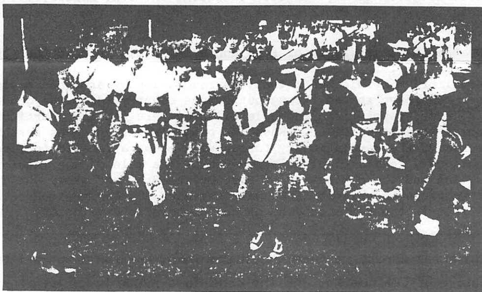
Guerrilla fighters of the Communist Party of Peru.